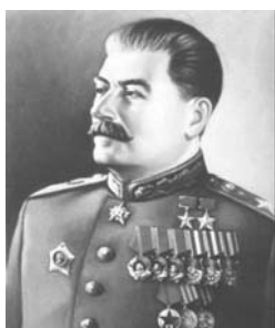
December 9, 1879 – March 5, 1953

“Decisions of individuals are always, or nearly always, one-sided decisions. In every collegium, in every collective body, there are people whose opinion must be reckoned with. In every collegium, in every collective body, there are people who may express wrong opinions. From the experience of three revolutions, we know that out of every 100 decisions taken by individual persons without being tested and corrected collectively, approximately 90 are one-sided.” — J. V. Stalin